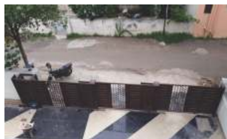
Telescopic Sliding Gate 3 Leaf

Residential Entrance Gate | Commercial Entrance Gate | Industrial Entrance Gate