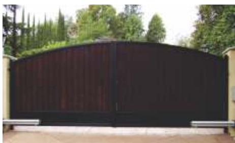
Auto Swing Gate