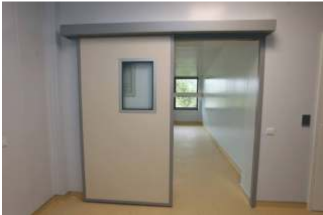
PUF INSULATED SLIDING DOOR