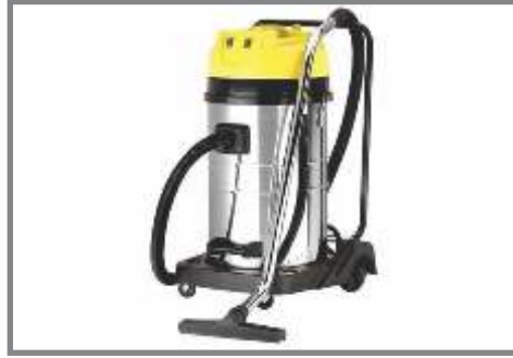
Wet & Dry Vacuum Cleaner