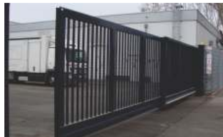
Telescopic Sliding Gate 2 Leaf