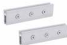
Glass Holding Bracket