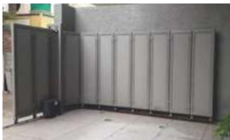
Auto Sliding Curve Gate