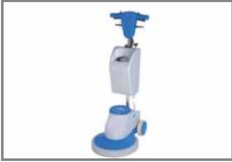
Single Disc Floor Scrubber