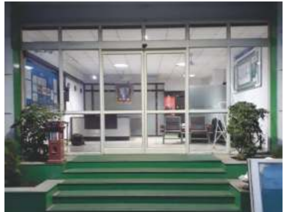
ALUMINUM SLIDING DOOR