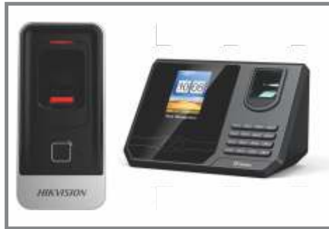
Biometric / Time Attendance System